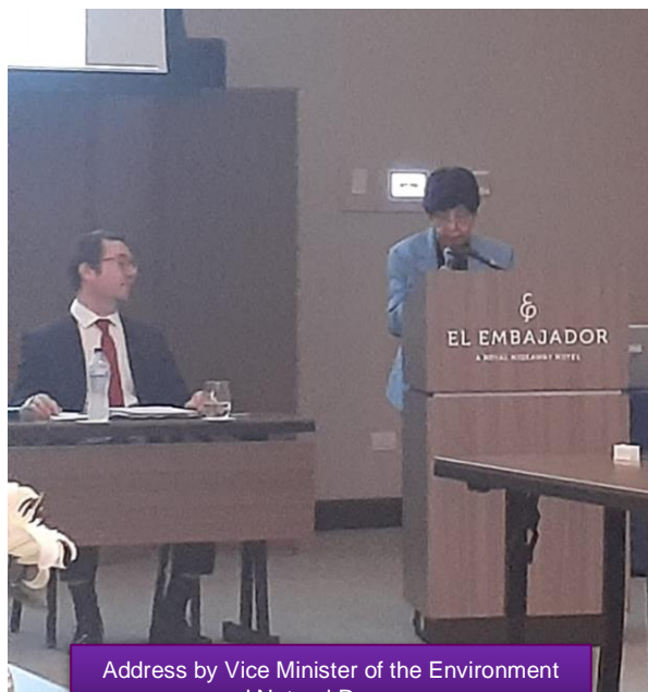
Address by Vice Minister of the Environment and Natural Resources