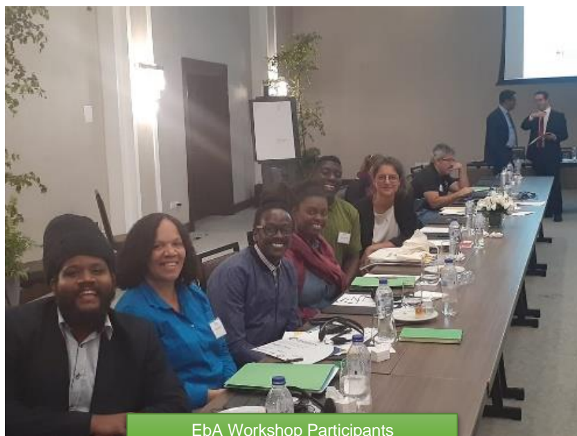
EbA Workshop Participants